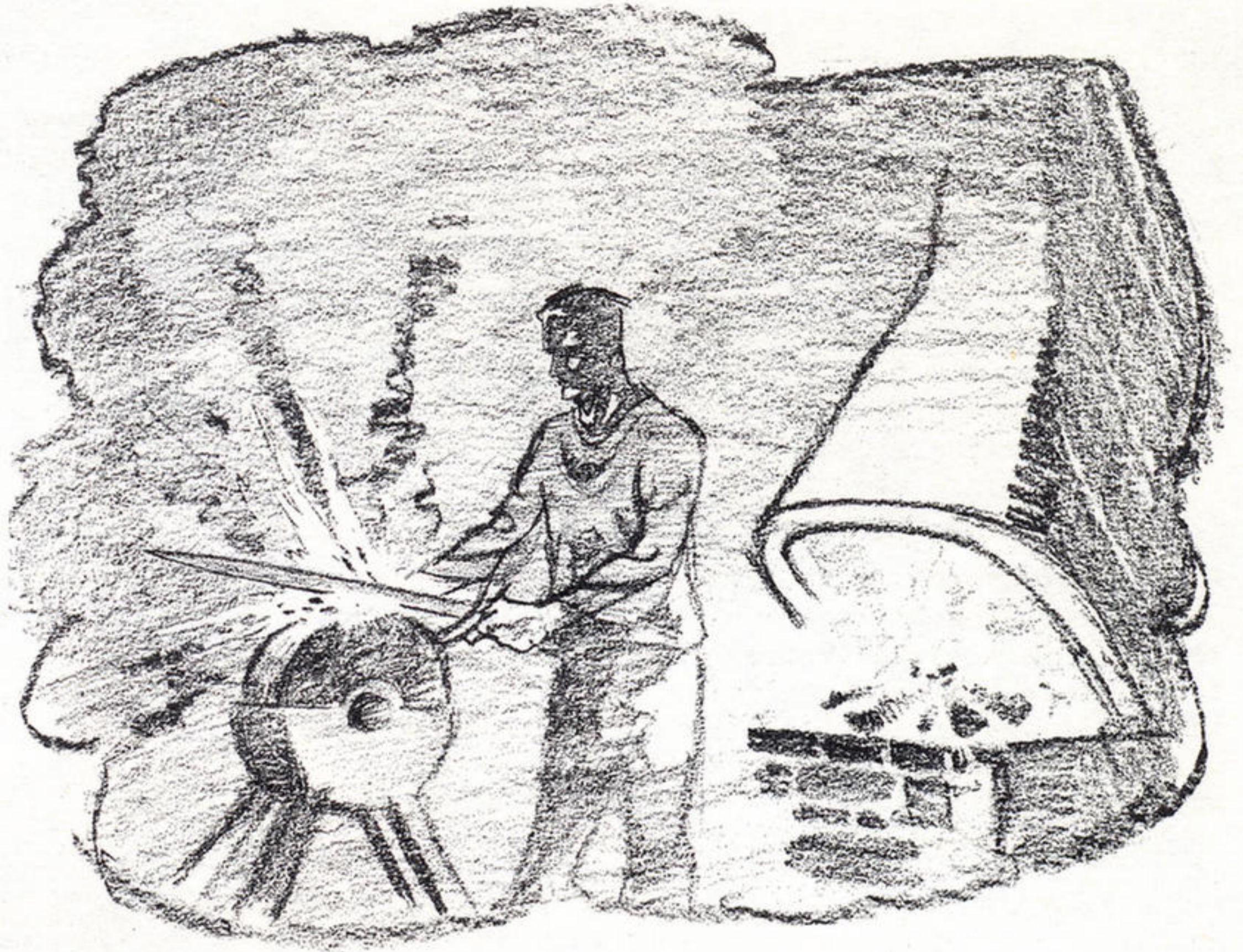
"MIDAE MEDITATES REVENGE"